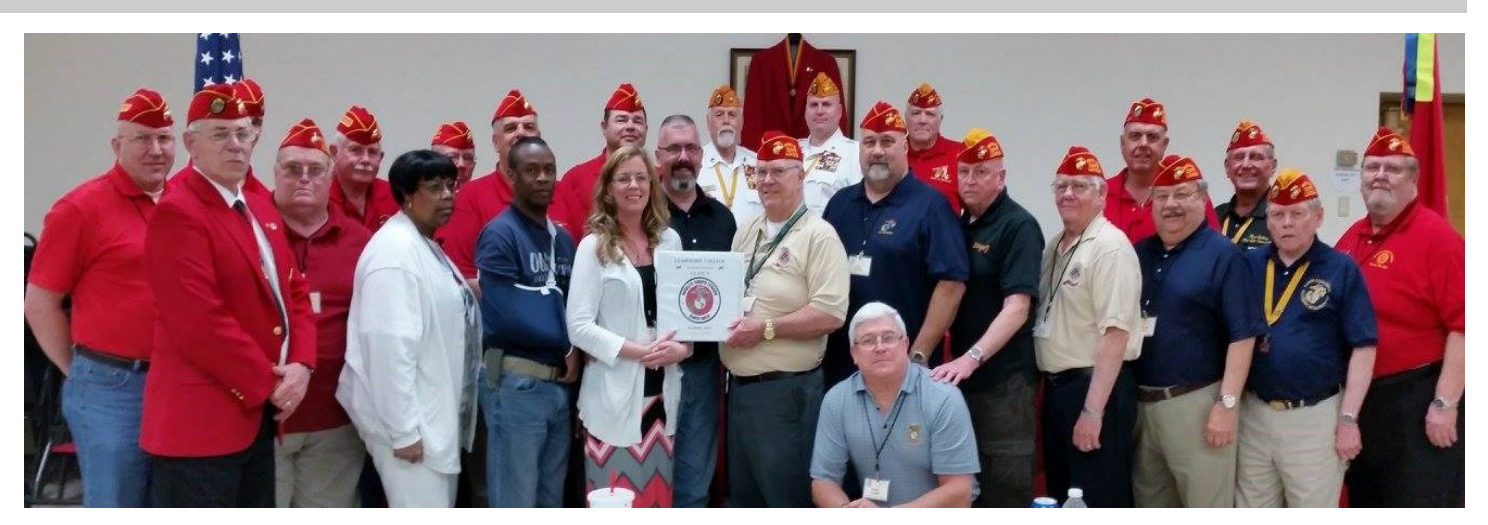
The 5th Annual Department Leadership College was held on 18 Apr 15 at the Glen Burnie VFW Post 160 (home of the Anne Arundel Detachment). The class included member from Delaware and West Virginia. Congratulations to all of the graduates.