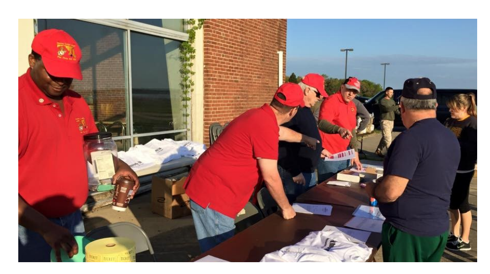
The Patuxent River Detachment working their Leatherneck 5K on May 3rd.